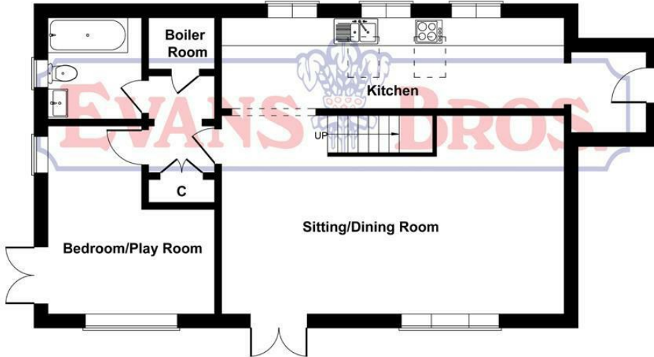
NANT YR ONNEN GROUND FLOOR

SKETCH PLAN FOR ILLUSTRATIVE PURPOSES ONLY All measurements walls, doors, windows, fittings and appliances, their sizes and locations, are approximate only. They cannot be regarded as being a representation by the seller, nor their agent.